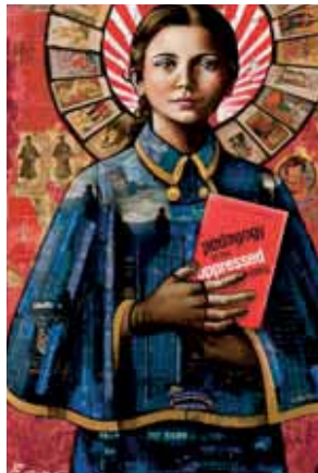
THE PATRON SAINT OF STUDENTS, GEMMA GALGANI, MIXED MEDIA COLLAGE AND ACRYLIC PAINT, 36 X 24"