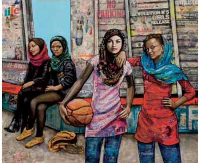
AMERICAN SCHOOLGIRLS III, MIXED MEDIA COLLAGE AND ACRYLIC PAINT, 60 X 72"